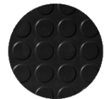
Circular studs (MC 7A)